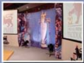
FA Premier League Stageset